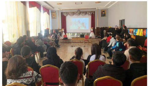
Students and parents show and explain the family photos during the advocacy campaign in the school's art hall. December 16, 2023