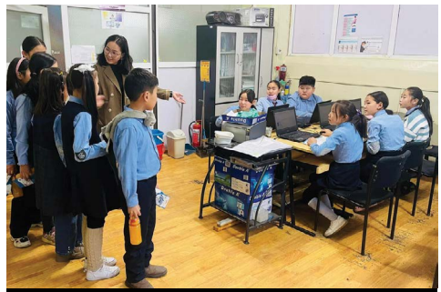
Primary grade students are visiting to a lower secondary class, School #39, December 4, 2023