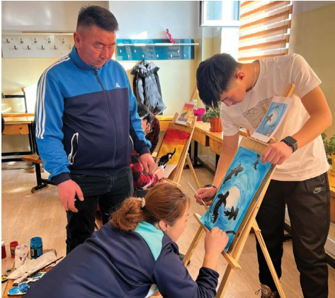
Student B of 11th grade is drawing a picture with his parents in the art classroom of school. December 16, 2023