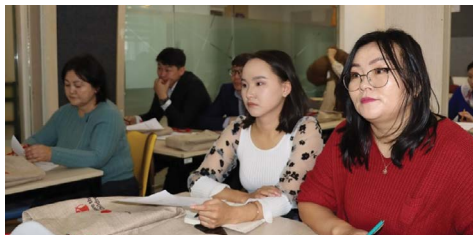
Participants of the workshop, training room of Innovation center of the Ulaanbaatar, November 20, 2023