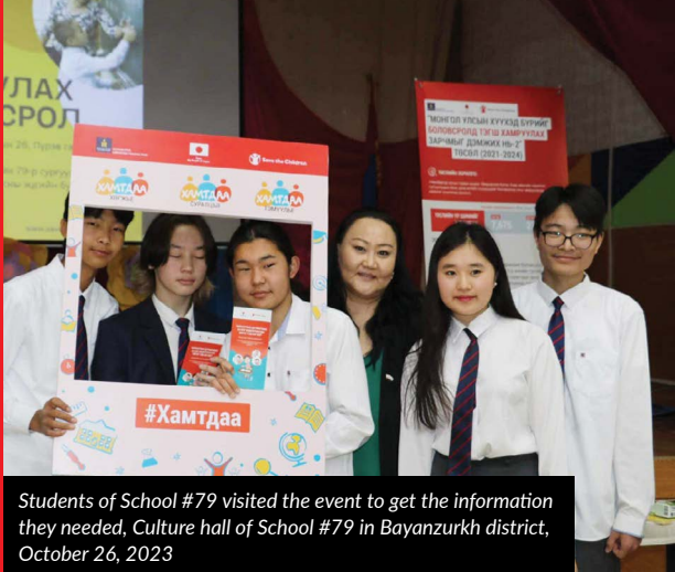
Students of School #79 visited the event to get the information they needed, Culture hall of School #79 in Bayanzurkh district, October 26, 2023

In order to increase the knowledge and understanding of parents, teachers, students, and the public about inclusive education and to provide information and advice, the "Inclusive Education" public event was organized on October 26, 2023, in the art culture hall of School #79 of Bayanzurkh district.