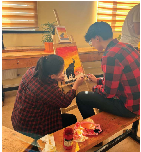
Student A of 11th grade is attending in the campaign activity with her mother in the art classroom of school. December 16, 2023

addition, the Education and Science Department has taken into consideration the work of organizing it in other schools as well and proposed implementing it.