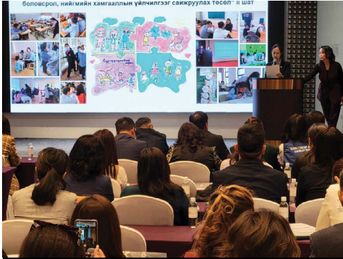
Training of sub-commissions of 21 provinces and 9 districts, the conference hall of the Millennium Hotel, May 16, 2023