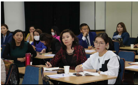
A consultation meeting of target districts' sub-commissions and school support teams, the training hall of the Mongolia-Japan Center, October 31, 2023