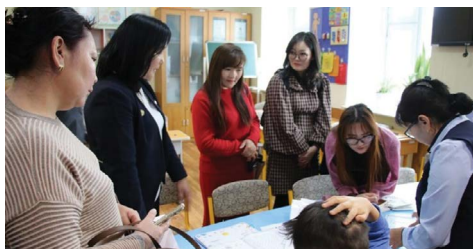
Participants visit CFS, School #79, November 21, 2023,