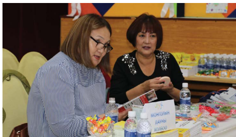
Representatives of the Mongolian Down Syndrome Association gave information to visitors

This awareness-raising public event was carried out jointly with the Autism Association of Mongolia, the Down Syndrome Association of Mongolia, the Mongolian National Federation of the Blind, the Deaf Education NGO, the Association of Parents with Differently-abled Children, and the Student Council members and teachers of School #79, a project's target school.