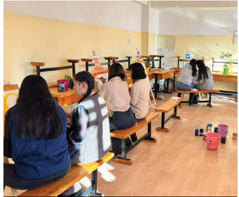
Students of 11th grade attended the activity "Let's create together" as part of the advocacy campaign with their parents at the school. December 16, 2023