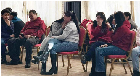
Students and parents are having a face to face conversation and opening their hearts during the advocacy campaign in the school's art hall. December 16, 2023