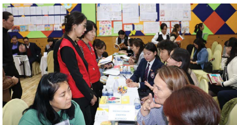
Members of the Student Council of School #79 gave information to the visitors