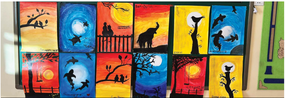
Cooperative and creative arts of students and caretakers who attended the advocacy campaign. December 16, 2023