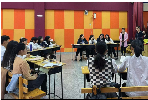
Learn together handbook dissemination workshop for students, School #127, October 10, 2023

Through the “Friend’s Program” campaign, lower-secondary-grade students studied with primary-grade students 2 hours a week after class. They helped the primary-grade students to do homework, read, and count.